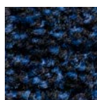
blue *discontinued item