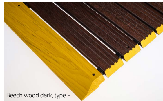
Beech wood dark, type F