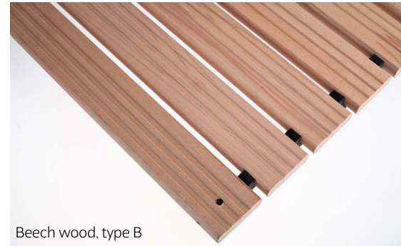
Beech wood, type B